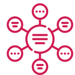
FULLY MANAGED Solution